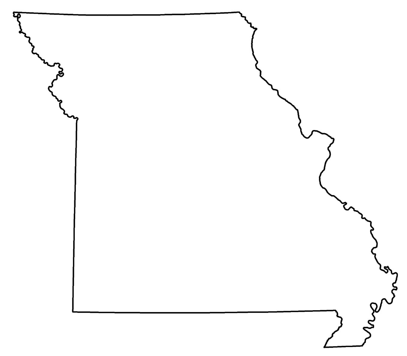
MoDOT's Statewide Projects